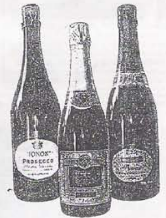
PROSECCO WINES from the Veneto region of Italy.