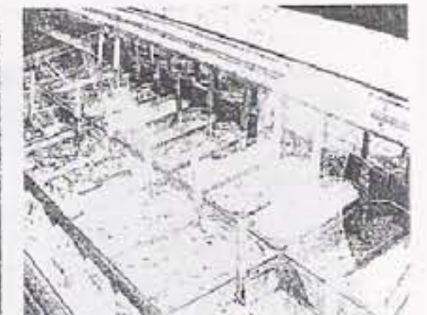
GELATO BAR at Pagliacci.