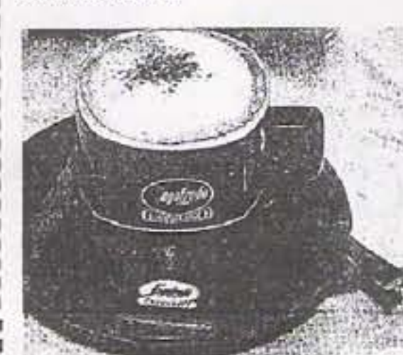
ITALIAN ESPRESSO at Segafredo.

Roma Mia will offer Italian dishes like Godfather chops and pawns in tomato Cream. Segafredo Zanetti brews excellent espressos in original, blended, cappuccino and cold versions.